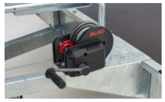
Winch with winch bracket