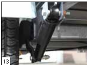
13 Option: shock absorbers mounted on axles.