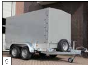
9 Option: raised cover mounted and spare wheel with support in front.