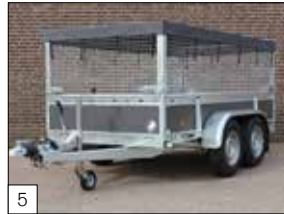
5 Option: wire-mesh rack with a height of 700 mm (removable) and a fine-mesh cargo net (mounted).