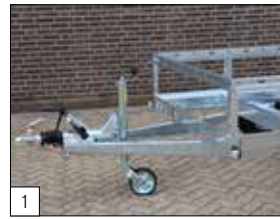
1 Standard: robust chassis, which is suitable for all single-axle versions up to and including 1800 kg Maximum Gross Weight.