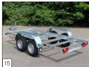
15 Option: model L-2 'Chassis', as an extra option, allows plywood floor plate, etc.