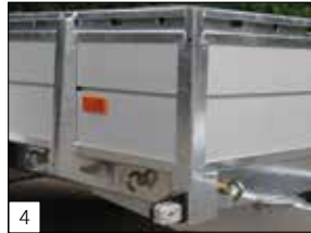
4 Option: boltable hooks on the outside.