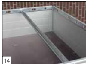
14 Option: load-restraint tubing mounted.