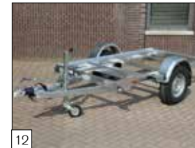
12 Option: model L-1 'Chassis', available as braked and non-braked version.