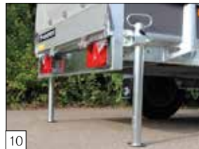
10 Option: sliding prop stands mounted with clamping bracket.