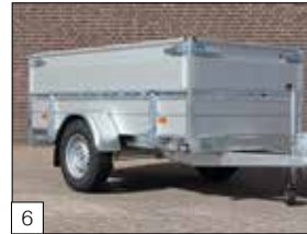
6 Option: removable aluminium walls with a height of approx. 40 cm, provided with durable locks.