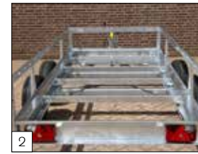
2 Standard: fully welded and galvanized chassis, which is suitable for all double-axle versions up to 3500 kg Maximum Gross Weight