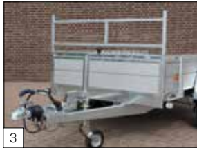
3 Standard: removable front rack.