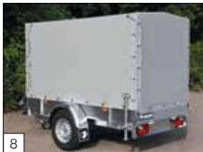
8 Option: raised cover mounted, different heights possible with prop stands including sliding clamp.