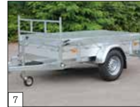
7 Option: flat cover mounted (grey).