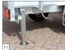
11 Option: adjustable, swivelling, telescoping prop stands and provided with removable crank.